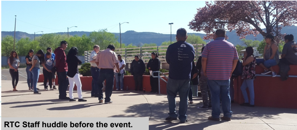
RTC Staff huddle before the event.