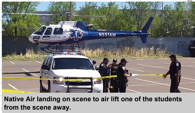
Native Air landing on scene to air lift one of the students from the scene away.