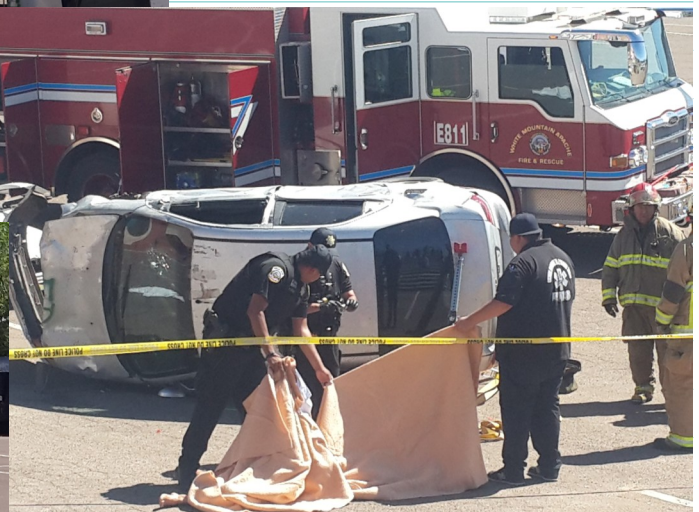
The scene being flagged off for an investigation due to a fatal accident. Reminder to always buckle up, don't drink and drive, & don't text and drive.