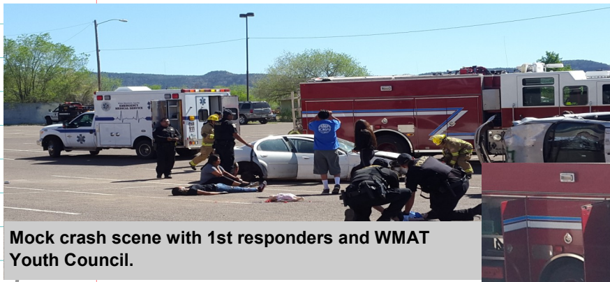
Mock crash scene with 1st responders and WMAT Youth Council.