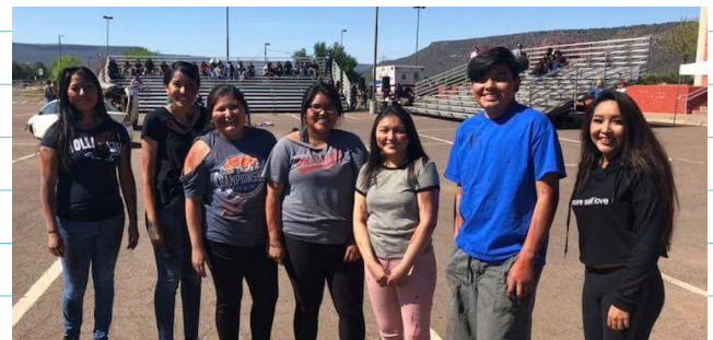
A huge thank you to the WMAT Youth Council for taking a part in the Arrive Alive event and speaking to their peers on their experience and encouraging them to be safe.