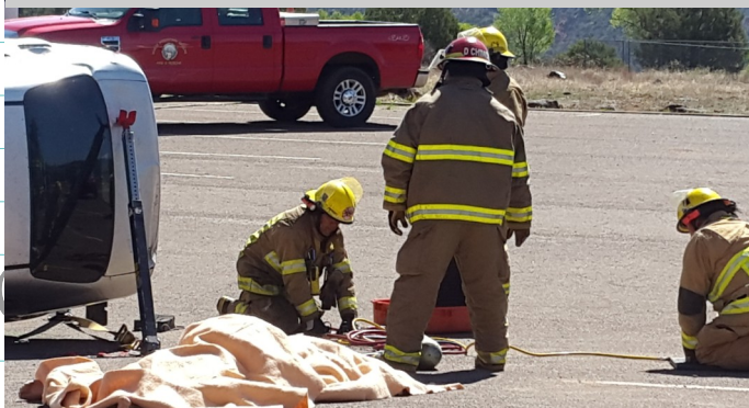
Fire & Rescue Dept. assisting on scene to extract a victim trapped under a vehicle.