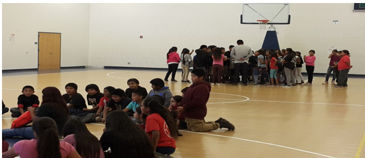
Staff members talking with groups of students at the Whiteriver Elementary School.