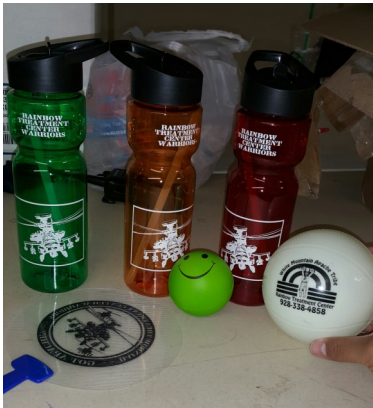
Water bottles, stress balls, basketballs, and fans were amongst some of the items passed out.