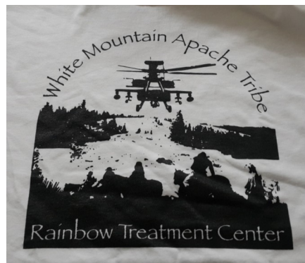
The design that sparked the idea for the float, which were printed on the t-shirts that were given