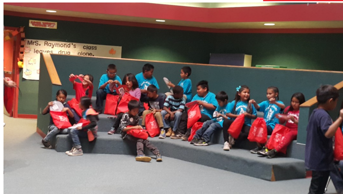
Students from Cradleboard Elementary going through the bags they received, which had RRW information, a Frisbee, water bottle, stickers, and a pencil pouch.