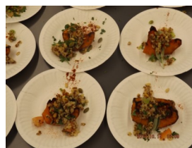
Roasted Butternut Squash