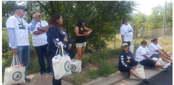
Some of the RTC staff waiting for the parade to start. Staff walked alongside the float passing out goodies and snacks.