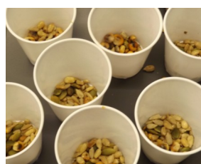
Western Apache Seed Mix

Rainbow Treatment Center will be CLOSED on Thursday & Friday, January 4-5, 2018 for their staff development.