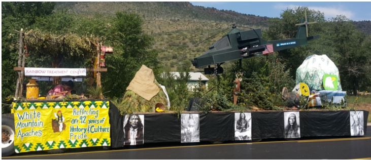
RTC's float for the 92nd Annual Tribal Fair & Rodeo.