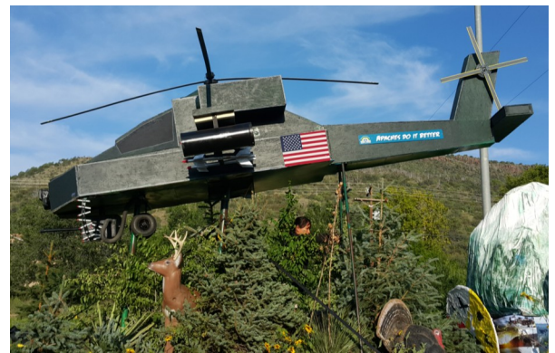
The Apache Helicopter was a big hit with the crowd as it made it's way down the parade route.

Each year the Rainbow Treatment Staff come together and help to make this an eventful and successful outreach during the Tribal Fair and Rodeo. This is the second year in a row the RTC Float has received 1st place in it's category. Thanks to all those who helped assist in getting the Apache Helicopter assembled. All departments came together to gather all the different materials needed to get the float completed. There was many hours put into getting this task done, right down to the day of the parade. Early Saturday morning, staff gathered to put on finishing touches. As the parade started, the float was escorted by RTC Staff all armed with a bag completely full of incentives and goodies to be given out along the parade route. Several vehicles followed with staff to make sure the