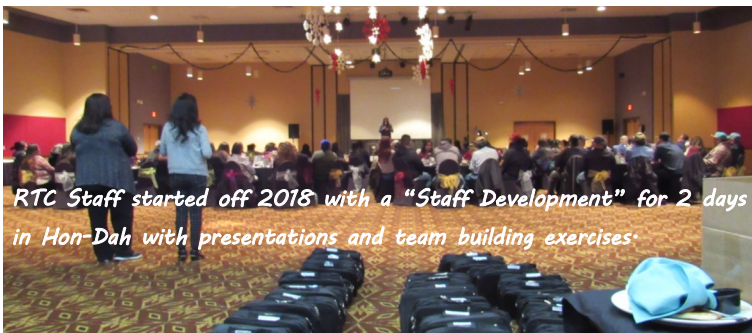
RTC Staff started off 2018 with a "Staff Development" for 2 days in Hon-Dah with presentations and team building exercises.