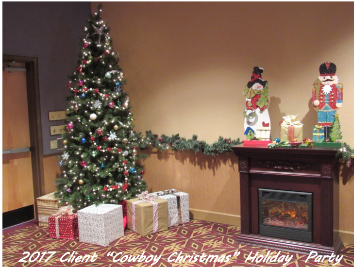
2017 Client "Cowboy Christmas" Holiday Party

Tune into KNNB for the RTC talk show every other Wednesday. On March 28 @ 11AM we will have the Scholarship Program on air.