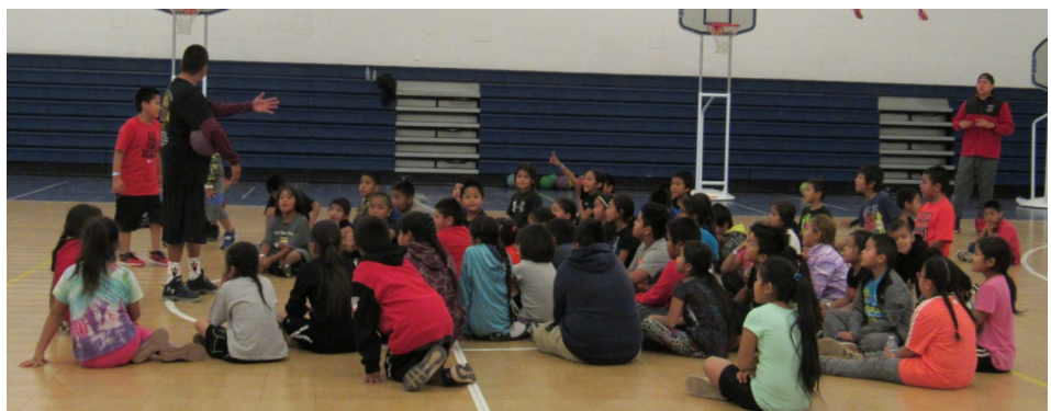
The students all gathered around listening to what is being said, while some eager to ask questions.

attendance and gave them a talk about the importance of education and her background story of growing up and how she got the opportunity to play in the WNBA. As the camp was completed, each of the students left with a t-shirt, water bottle, and an Under Armour backpack provided by RTC but the best sight was to see them leave with a smile of gratitude. With the rousing success of the Rainbow Treatment Center Basketball Camps in 2017, will be hosting a few more camps in 2018. So keep an eye out for the flyers and we look forward to working with more of the youth at these upcoming events.