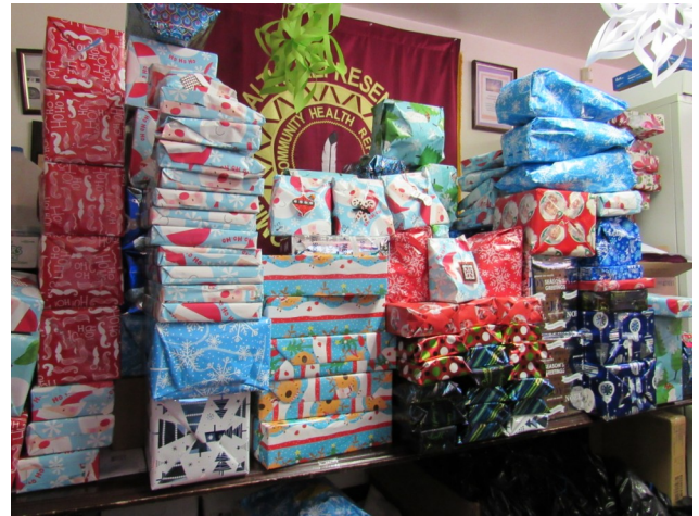
Staff wrapped hundreds of gifts for all the children in attendance of the Holiday Party.

held on December 13, 2017 at Hon-Dah was a huge success. Clients and their families enjoyed a delicious holiday meal followed by desserts. They were also given a chance to take photos with Santa.