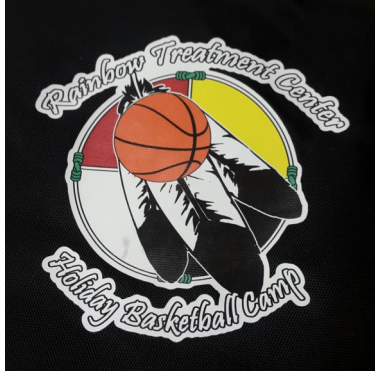
The design on the Under Armour bags given to all participants.